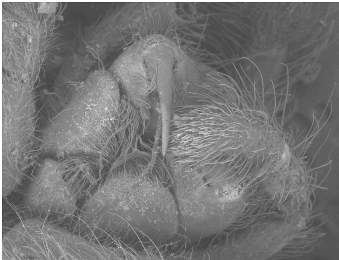
Spider's Fang at 80x Magnification

A: The field of nanoscience was born during the 1980s and 1990s with the discovery of unique nanoscale forms of carbon that could be engineered into a variety of custom forms. Also, a new class of instruments that are capable of high-resolution viewing and manipulation of single atoms were invented. The National Nanoscale Initiative (NNI) provided federal funding to rapidly move these developments from the lab to commercial products.